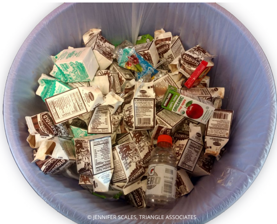
FIGURE 3. SINGLE-USE DISPOSABLE MILK CARTONS ARE EITHER COLLECTED FOR RECYCLING OR DISPOSED OF IN THE TRASH. PHOTO FROM MEAL SERVICE WASTE SORT STATION AT A SCHOOL IN AUBURN SCHOOL DISTRICT, WA IN 2020. 16

An important note to consider is many waste haulers are in the process of ending milk carton collection for recycling , creating a significant increase in carton waste being sent to the landfill that had previously not been accounted for with schools. For schools that are experiencing new waste coming from cartons, BMDs are a potential leverage point to reduce waste generation, associated hauling costs, and remaining recycling fees from milk contamination.