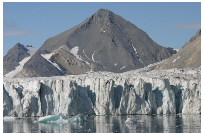
Glacier front and calving. Svalbard, Norway.

the summer forcing the bears to move onto land for long periods of time each year. Hudson Bay is the best example of such conditions, while the bears in Foxe Basin, Davis Strait and Baffin Bay also remain on land for part of the year when the sea ice in these areas thaws. Other populations live under the harshest and coldest climatic conditions that exist, where the sea ice is present all year round. This applies to the northern areas of Canada and Greenland. In other areas, polar bears live in the pelagic regions of the polar basin (i.e., areas linked to the open sea where there are huge seasonal variations in the ice cover and the bears follow the ice edge despite the fact that this results in long-distance seasonal movements). Movements northwards of up to 1,000 km during the summer are not uncommon from the areas around the Bering Strait where the sea ice extends a long way southwards during the winter. The polar bear's habitat is therefore adjusted to accommodate regional conditions and it can be vast in areas where there are large seasonal and annual variations in the ice cover, while it is much smaller in those regions where conditions are more stable.