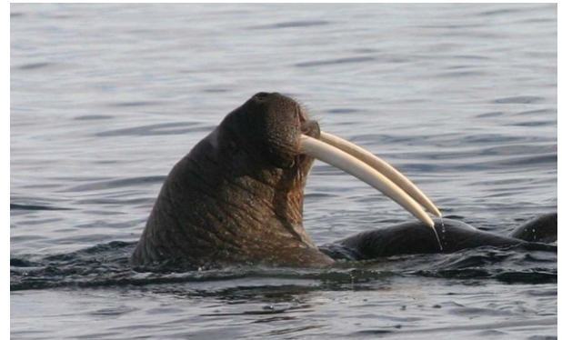
Polar bear prey: Walrus ( Odobenus rosmarus ).