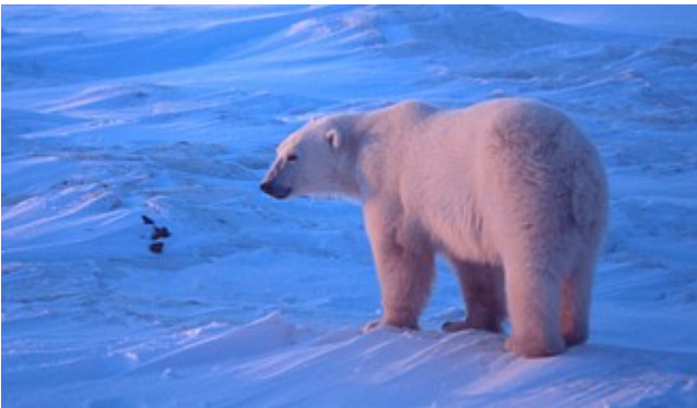
Polar bear ( Ursus maritimus ). Churchill, Manitoba, Canada.

The polar bear is a formidable predator and ranks at the top of the arctic food chain.