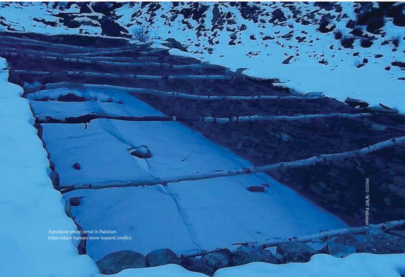
A predator proof corral in Pakistan helps reduce human-snow leopard conflict.

A social survey conducted in the Khunjerab and the Central Karakorum National Parks in Gilgit-Baltistan found a decline in snow leopard killings since 2013, due in part to AHM Project conservation awareness raising and anti-poaching activities in this region.