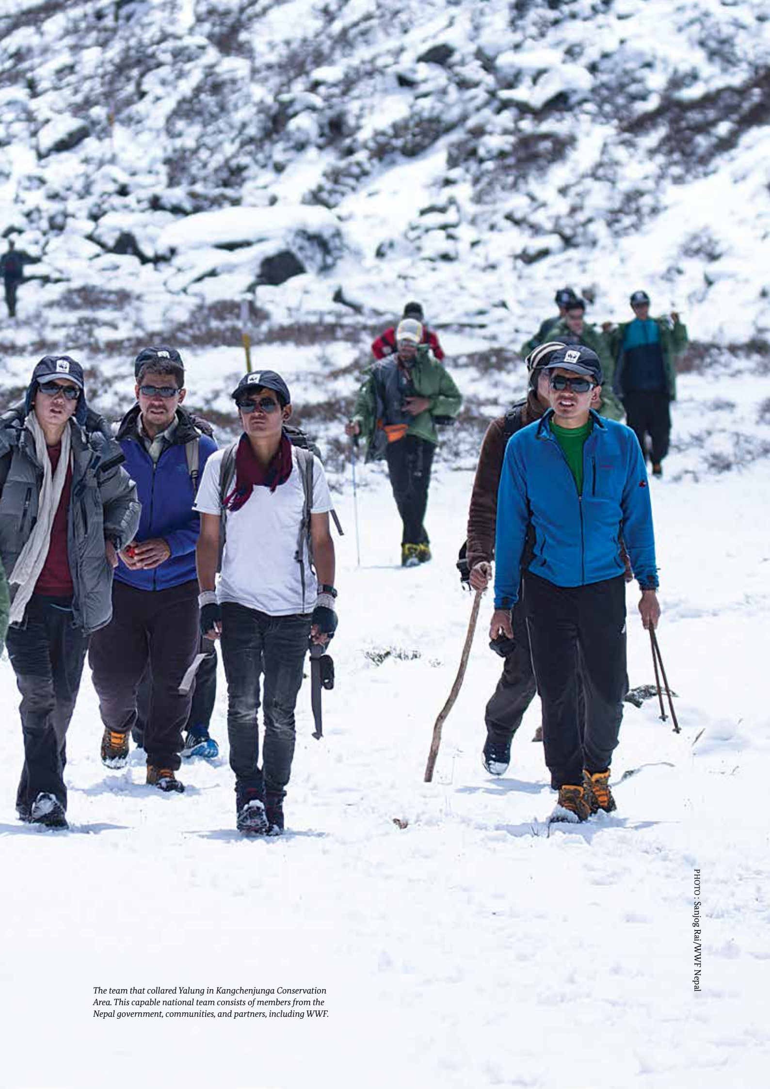
The team that collared Yalung in Kangchenjunga Conservation Area. This capable national team consists of members from the Nepal government, communities, and partners, including WWF.