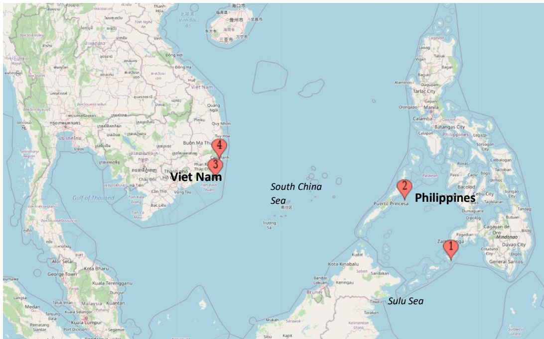
Figure 1. Project Sites: (1) Zamboanga City, Zamboanga Peninsula, Philippines; (2) Green Island, Roxas, Palawan, Philippines; (3) Thuận Nam District, Ninh Thuan province, Vietnam; (4) Ninh Hòa District, Khánh Hoà Province, Vietnam

The project will be implemented in two sites in the Philippines and two sites in Viet Nam. Three of the sites are marine waters and the second site, in Viet Nam, comprises land-based coastal ponds that are being converted from shrimp to Caulerpa lentillifera culture. The Project sites are marked on the map in Figure 1.