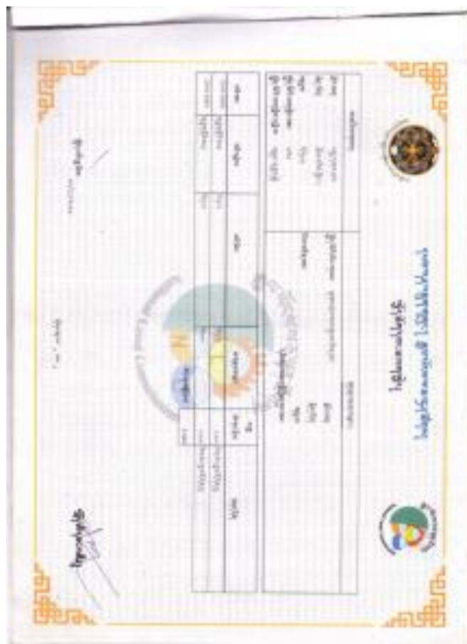
land user certificate for the construction

Community clearance have been received from the relevant authority. The land was allocated by the Nganglam Dungkhag as a government institutional land in the name of Divisional Forest Office, Pema Gatsel after obtaining all the necessary clearance from communities and other relevant agencies.