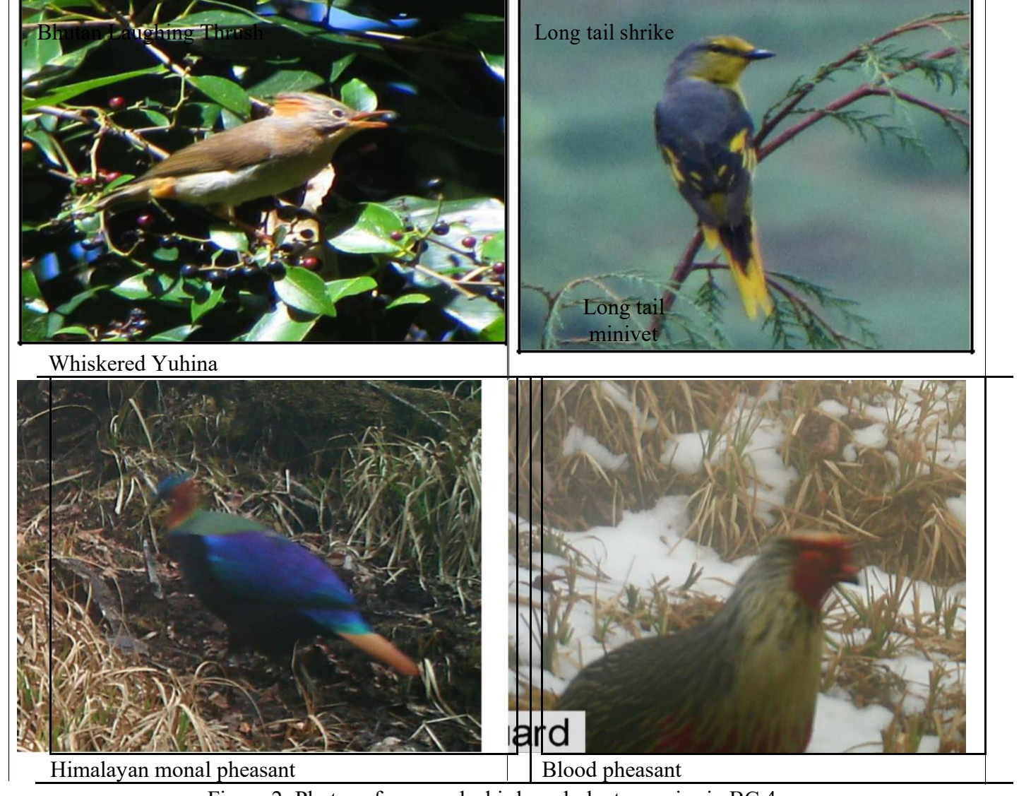
Figure 2: Photos of mammals, birds and plants species in BC 4

BC 4 covers four Gewogs as given in the Table 1. People in the area are mostly Khengpa. It has 74 households permanently inside the BC4 and 250 households in its buffer area. Socio Economic Survey conducted from the year 2015-2016 reveals that there are two dialect speaking community living in and around the corridor boundary. It holds a population of 7653. The ratio of men and women are almost equivalent with 3869 men and 3784 women as seen in the graph in the Figure 3.