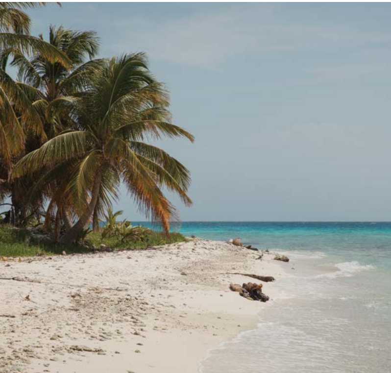
Above and right: © Audra Melton

Through these studies, bottlers have realized their exposure to potential water risks from uncontrolled fire in their source water areas and have helped build the awareness of local communities regarding the importance of fire prevention and control, while also investing in on-the-ground projects.