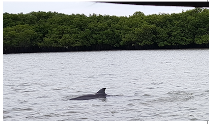
Dolphin in protected mangroves, El Morro, Ecuador