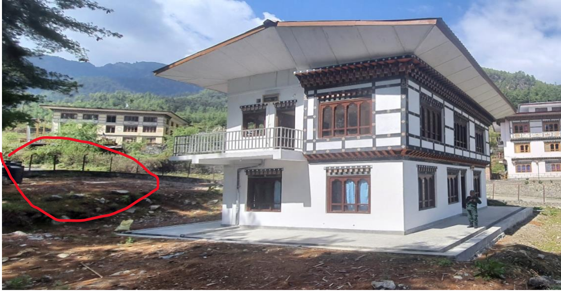
Figure 4: Proposed site for water tank