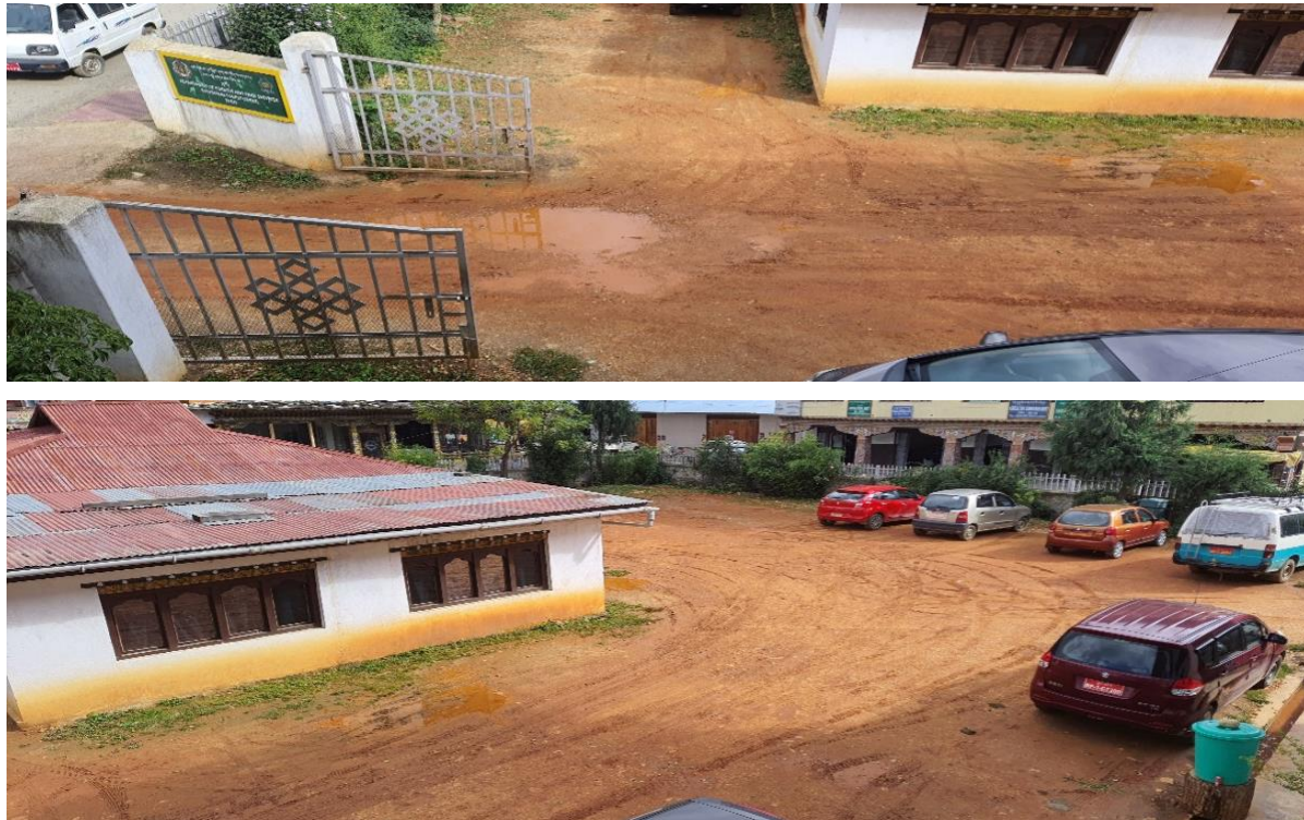
Figure 3: Blacktopping of office compound

There are 10 buildings in the vicinity of the project area including commercial hubs with hotels, shops, and rental apartments. No effect is foreseen to the people residing in the buildings because of the project. Water will be sourced from the existing water connection of the office and about 1000 liters of water might be used for the project on daily basis. For blacktopping, materials required will be bitumen (743.80 sq.meter).