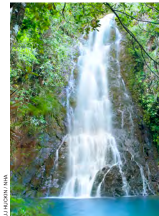
J.J. HUCKIN / NHA

Join us to explore the coral reefs and coastal mangroves of Belize that are home to a diverse array of life—from sea turtles that glide through clear waters to vibrant corals that stud the ocean floor. WWF and our partners have been working in Belize for decades, monitoring and restoring coral reefs, protecting marine species, safeguarding the watershed, and promoting sustainable tourism and fisheries. Despite its size—Belize is one of the world's smallest countries—a wealth of wonders is tucked within the country's