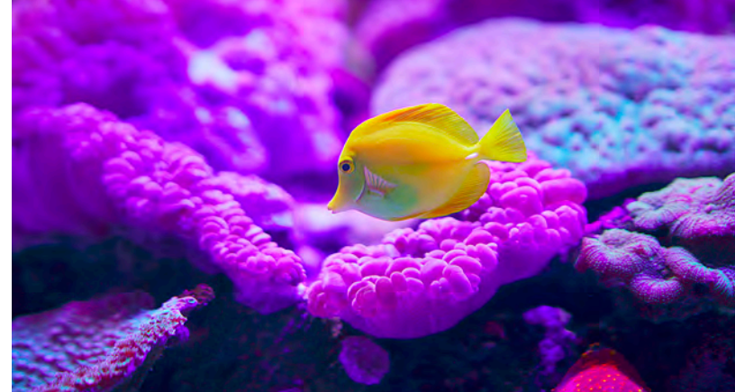
RED TEA / ISTOCK