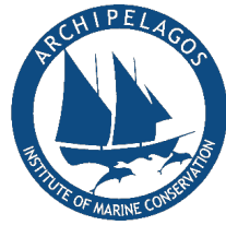
Archipelagos Institute of Marine Conservation