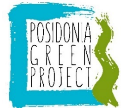
Posidonia Green Project