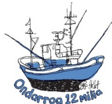
Ondarroa 12 Milia