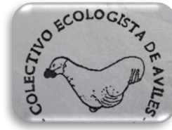
Colectivo Ecologista de Avilés