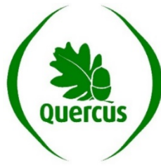
Quercus - Associação Nacional de Conservação da Natureza (ANCN)