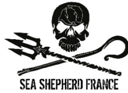
Sea Shepherd France